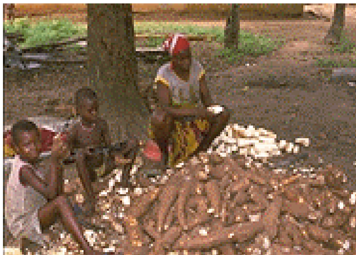
Cassava production, Mozambique