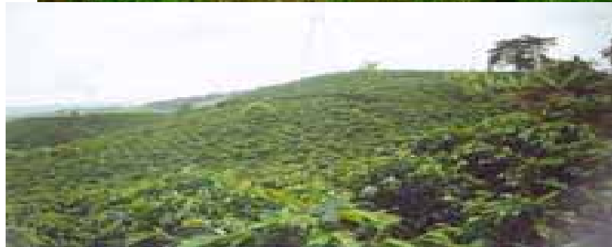
Coffee production, Kenya